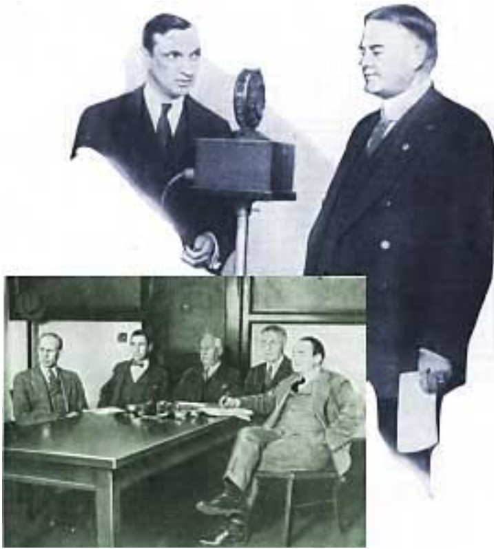
Herbert Hoover 1874-1964

Broadcasting uses a “ a great national asset, ” i.e. the spectrum,