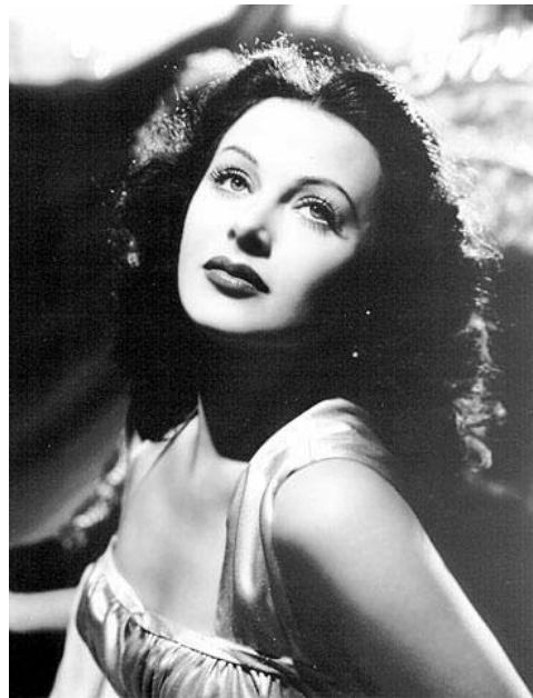
George Antheil (1900-1959)